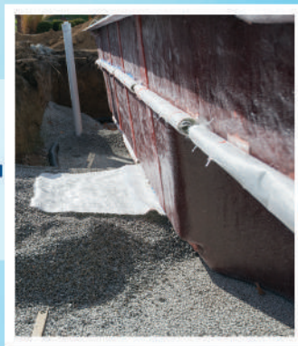
Geo-Anchor Pool Wall™